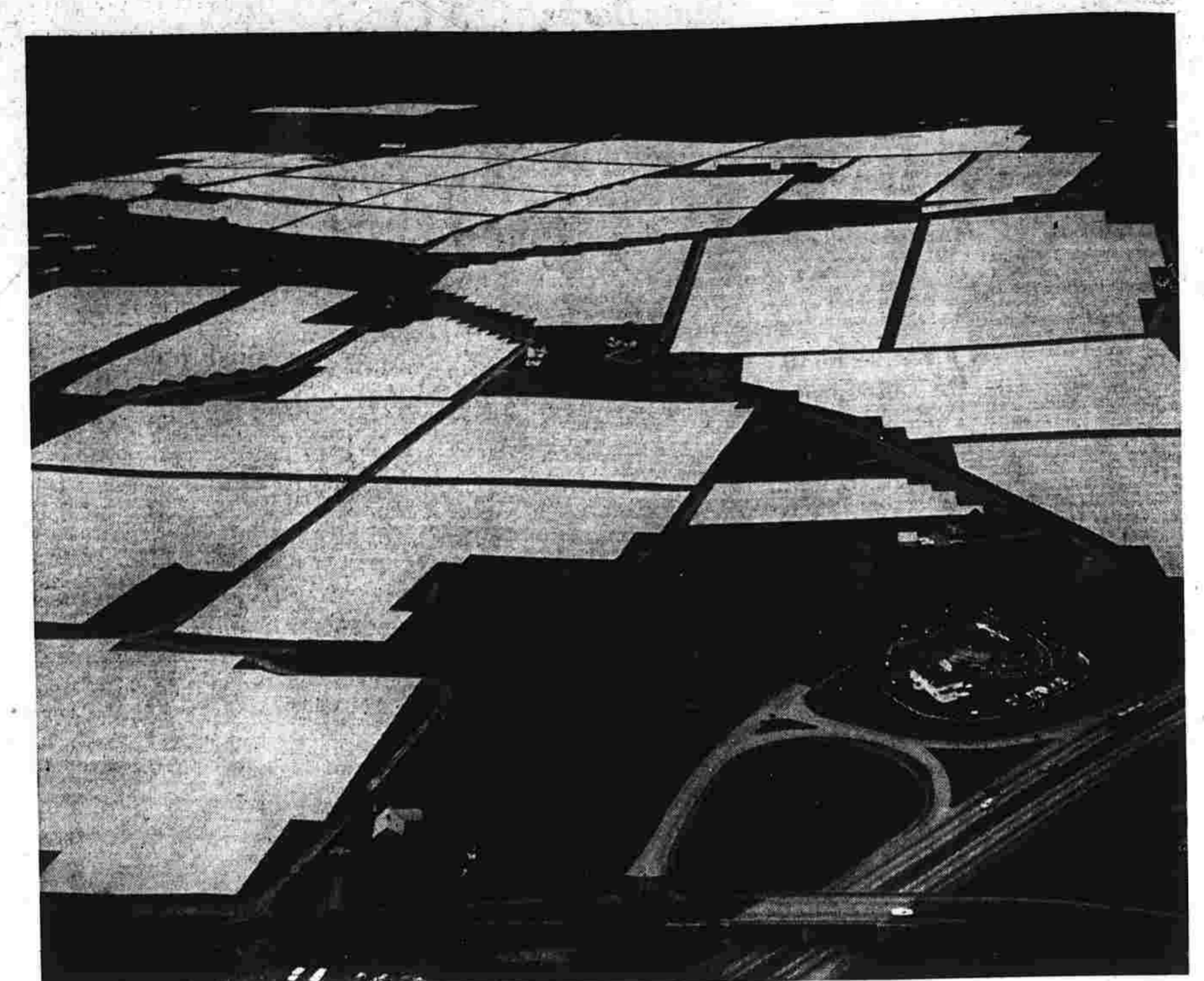
SHADEGROWN AT BUCKLAND.

Town departments submit budget request for 1966-67 totaling $5,453,408—some $1,940,856 more than the town is expected to spend by the end of the current fiscal year.