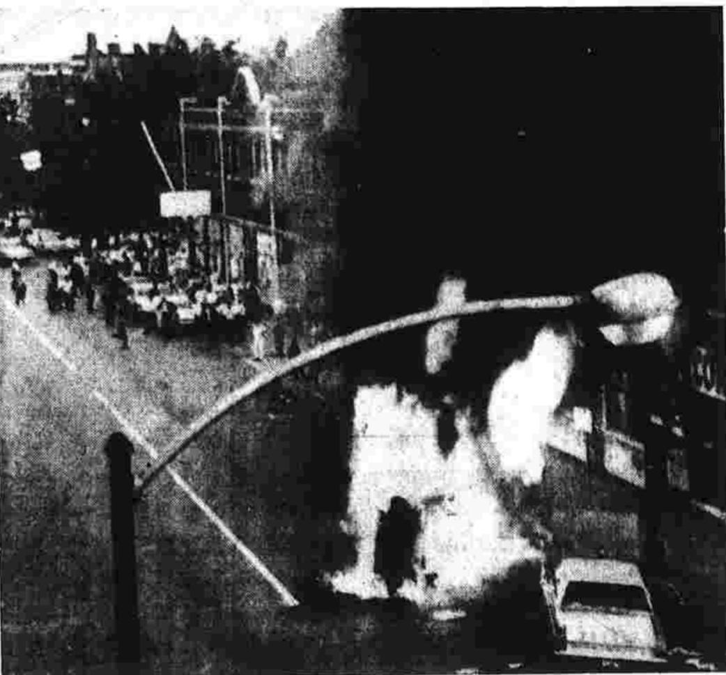
Flames rise from overturned police car, set afire by an unruly Chicago mob. Disorder broke out in the city's Latin-America neighborhood last night after a man was shot in the leg while police were trying to break up a gang fight.